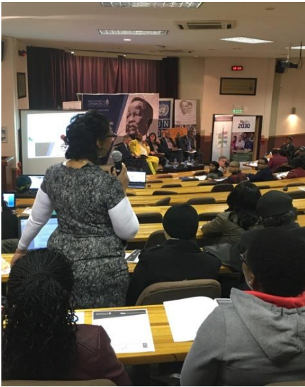
An audience member addresses the panelists

In order to successfully implement development strategies, there is a recognized need to adhere to a “bottom-up” approach. The processes of both the NDP and SDGs emphasize inclusivity and ensuring that no-one is left behind. The challenge is: how do we implement this? What does CBDR mean in terms of responsibility to policy makers? Furthermore, how do we ensure that implementation is marked by full integration of social, economic, and environmental levels of sustainable development?