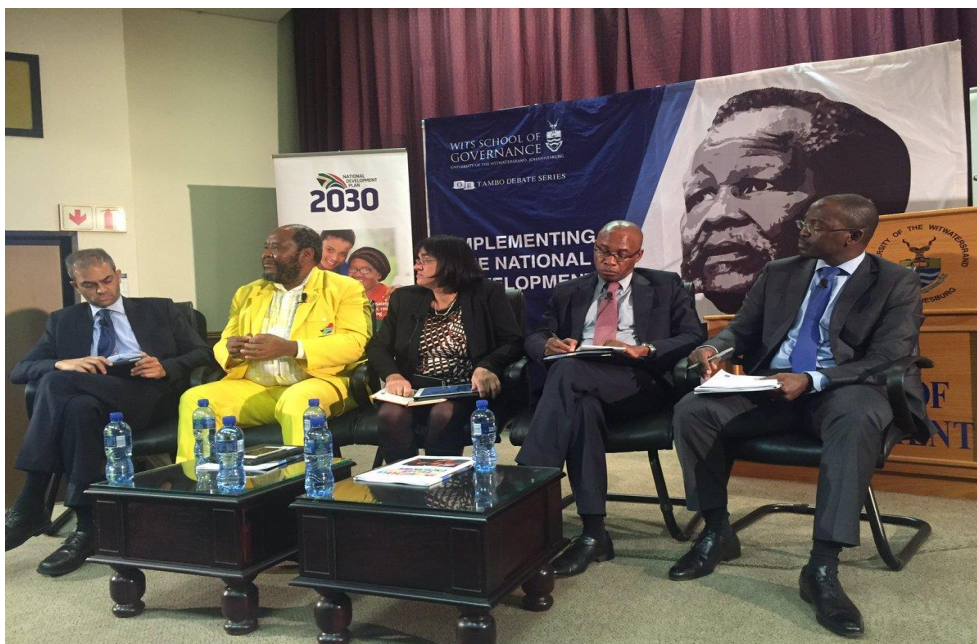
The moderator and panelists